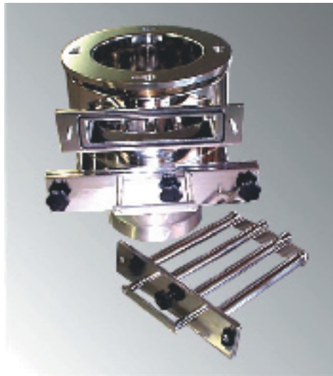
Version: MAGNETBOX EASY CLEAN PHARMA